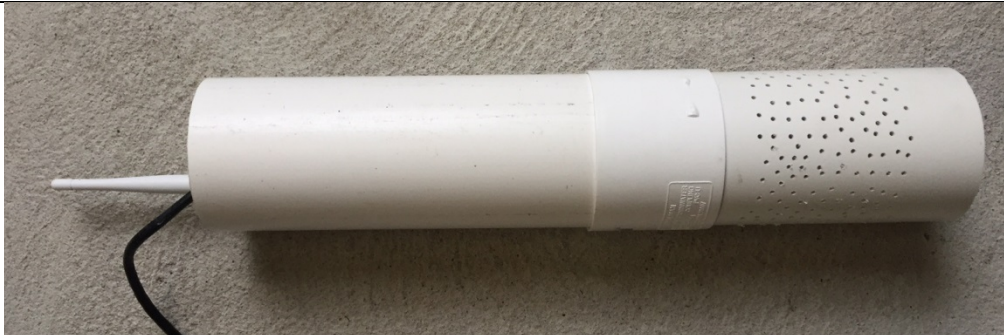
Shots of in-silo monitoring system featuring a WiFi infra-red camera with modified internals and optimised for macro photography