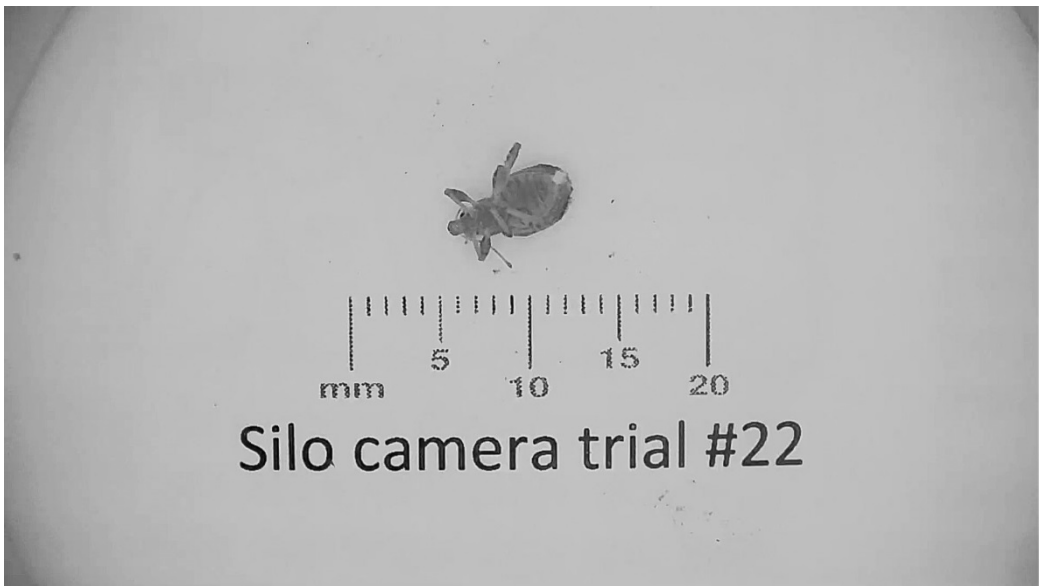
Relayed images from the in-silo monitoring insect trap showing a successfully trapped rice weevil

Initial designs were refined and constructed with a first-prototype of the powered thermosiphon and remote monitoring pest identification camera built.